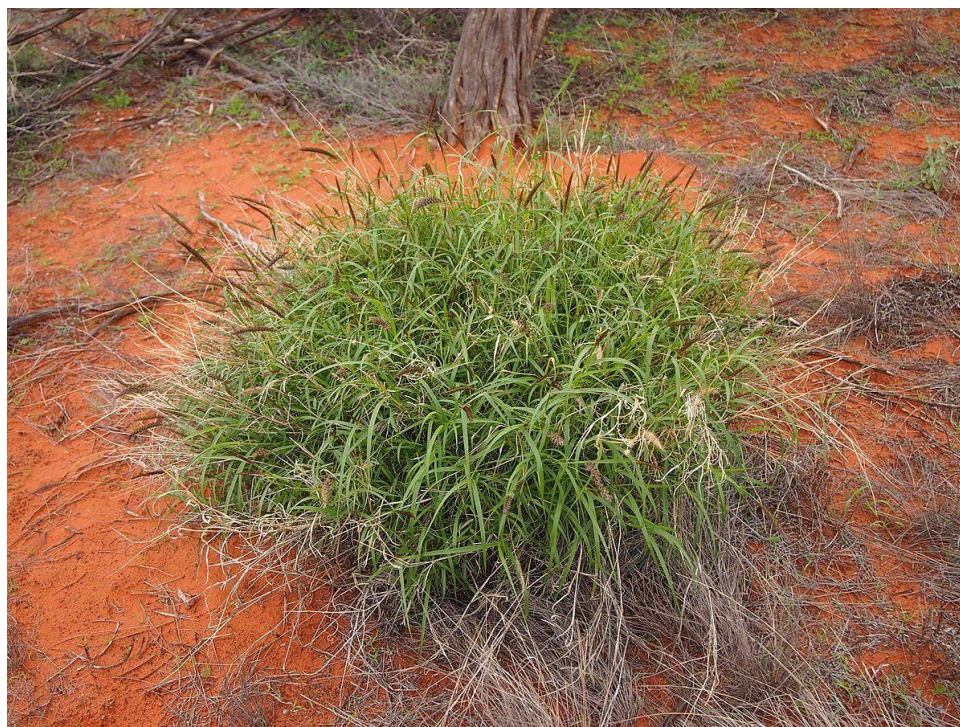
Figure 2: Image of Cenchrus ciliaris (Buffle Grass)